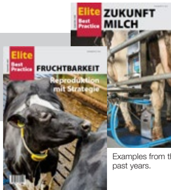
Examples from the past years.

Elite Best Practice is planned again for 2023.